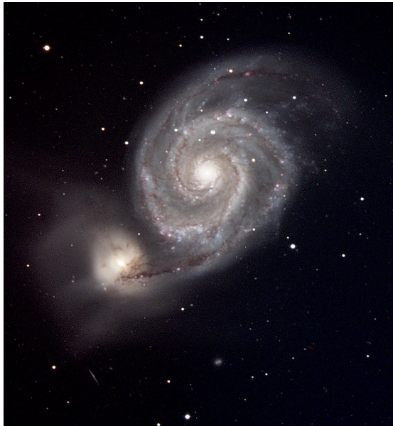
Spiral galaxy M51 with companion galaxy NGC 5195.

We are committed to sharing the wonders of the universe and we achieve our goal through regular public lecture programs and star parties, by publishing a monthly bulletin of articles and events, and through our website.